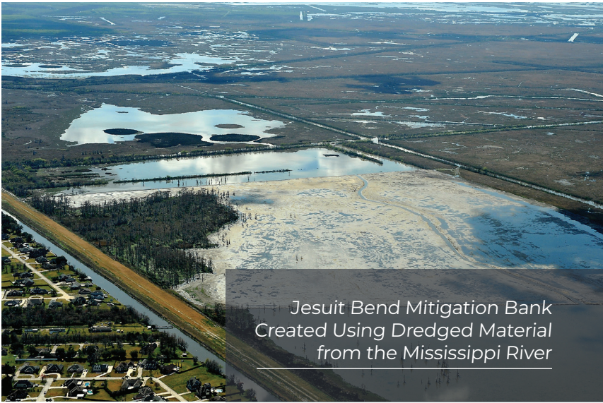
Jesuit Bend Mitigation Bank Created Using Dredged Material from the Mississippi River

Some examples of these projects are the Jamaica Bay (NY) wetlands creation program which came out of partnering discussions with the USACE to utilize dredged material to rebuild eroding wetlands; Kings Bay (GA) regional sediment management which takes dredged material which used to go to sea due to costs and rationalizes the costs in combination with a nearby beach project to create beach habitat; and Jesuit Bend mitigation bank which is the first of its kind mitigation bank to create wetlands using