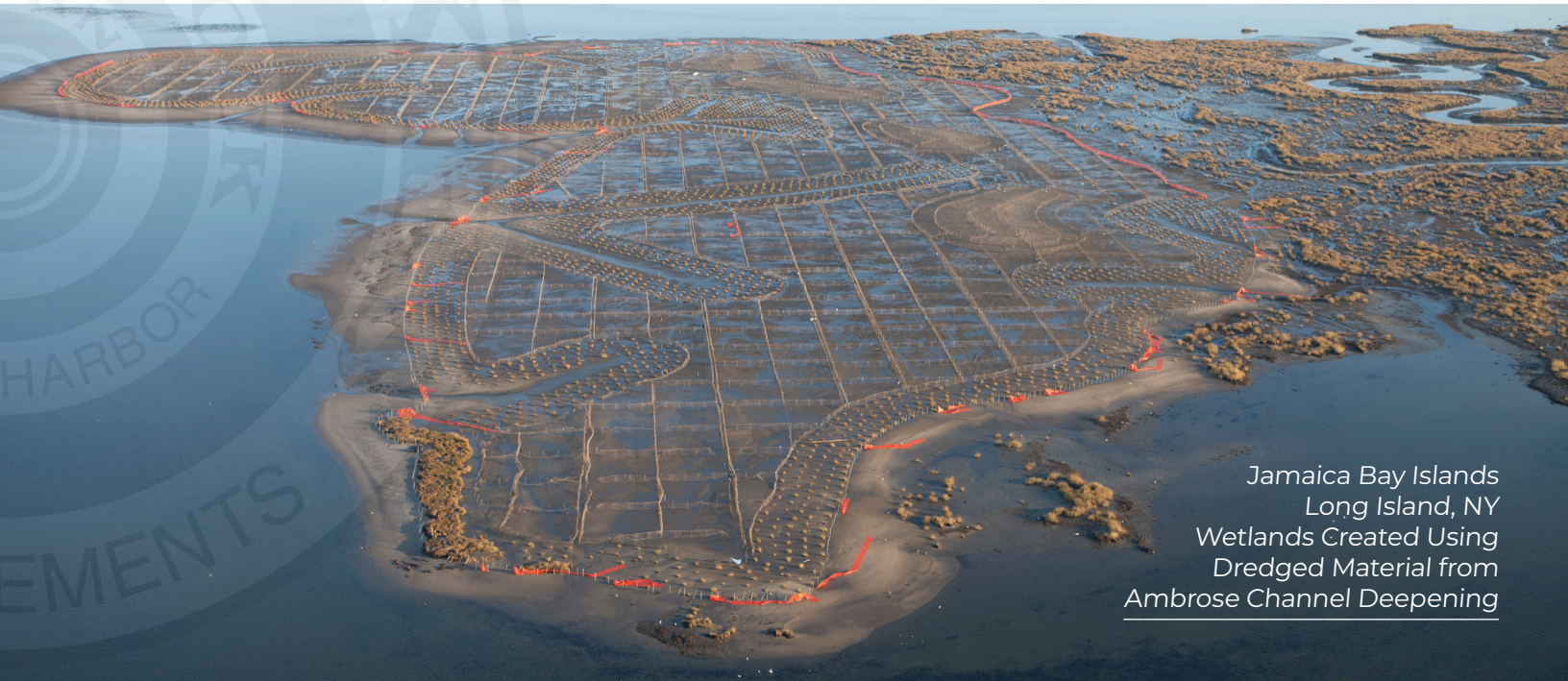
Jamaica Bay Islands Long Island, NY Wetlands Created Using Dredged Material from Ambrose Channel Deepening

The definition of beneficial use continues to expand as the practice develops, but while the emphasis may be new, the concept is not since many contractors have been engaged with BUD in many forms over years.