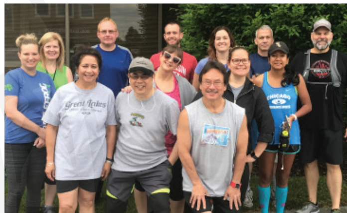
Making Strides Against Breast Cancer Walk