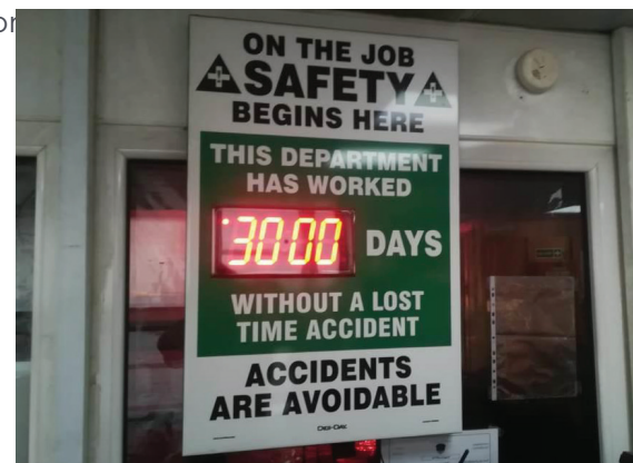
Dredge Ohio's Safety