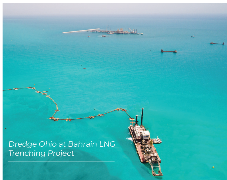
Dredge Ohio at Bahrain LNG Trenching Project