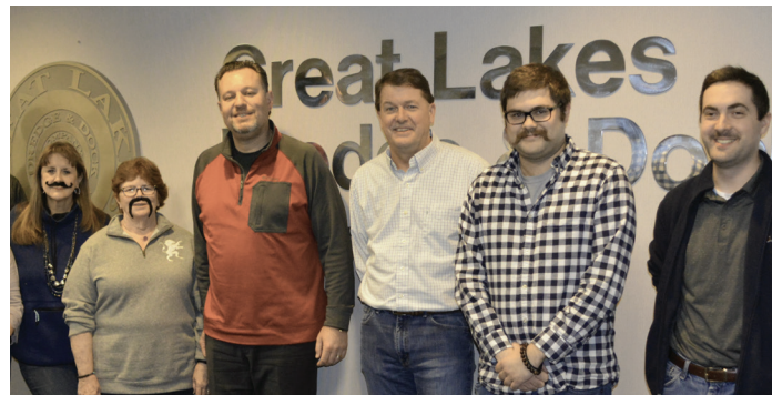
Movember Men's Health Awareness