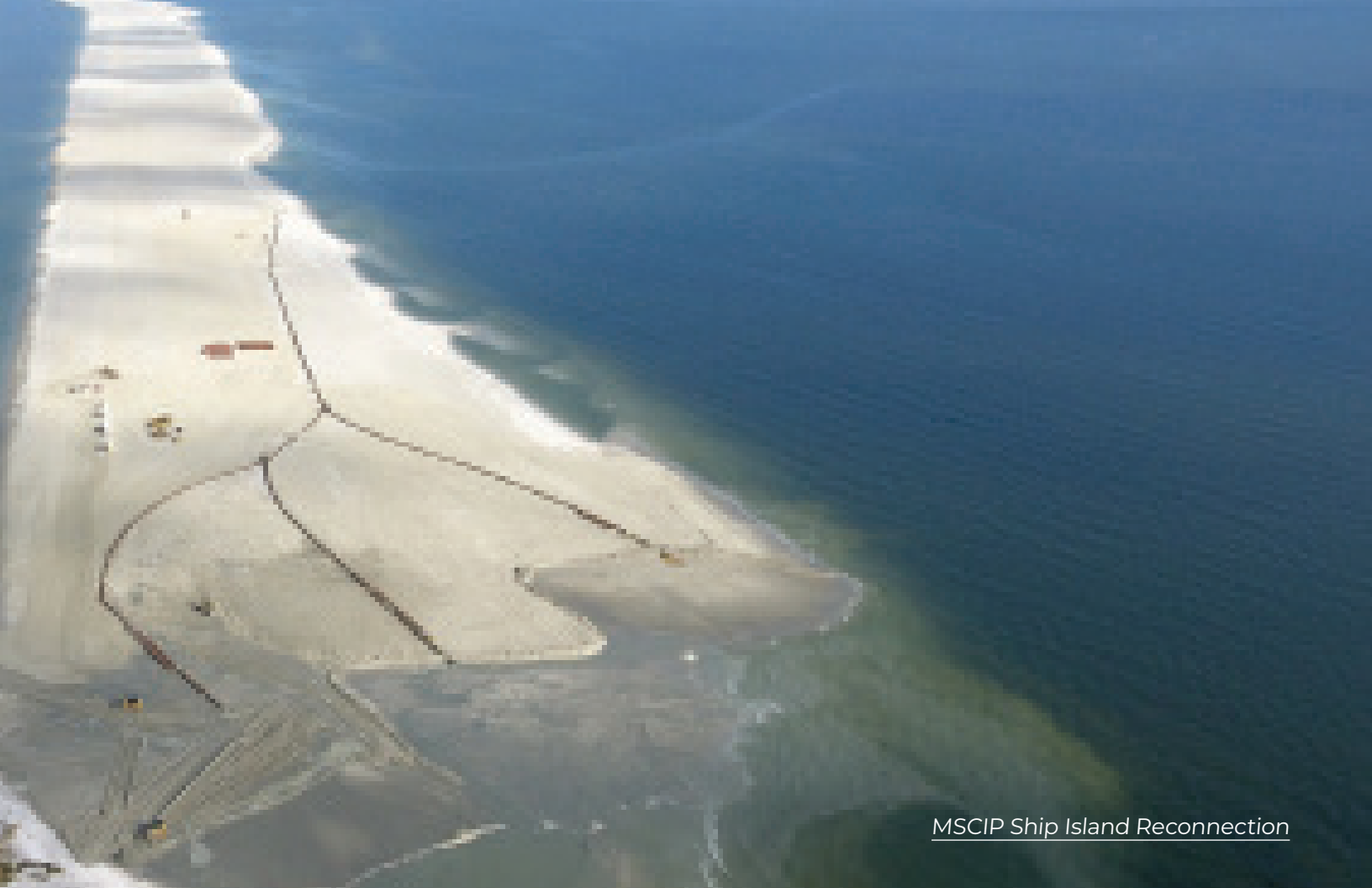
MSCIP Ship Island Reconnection