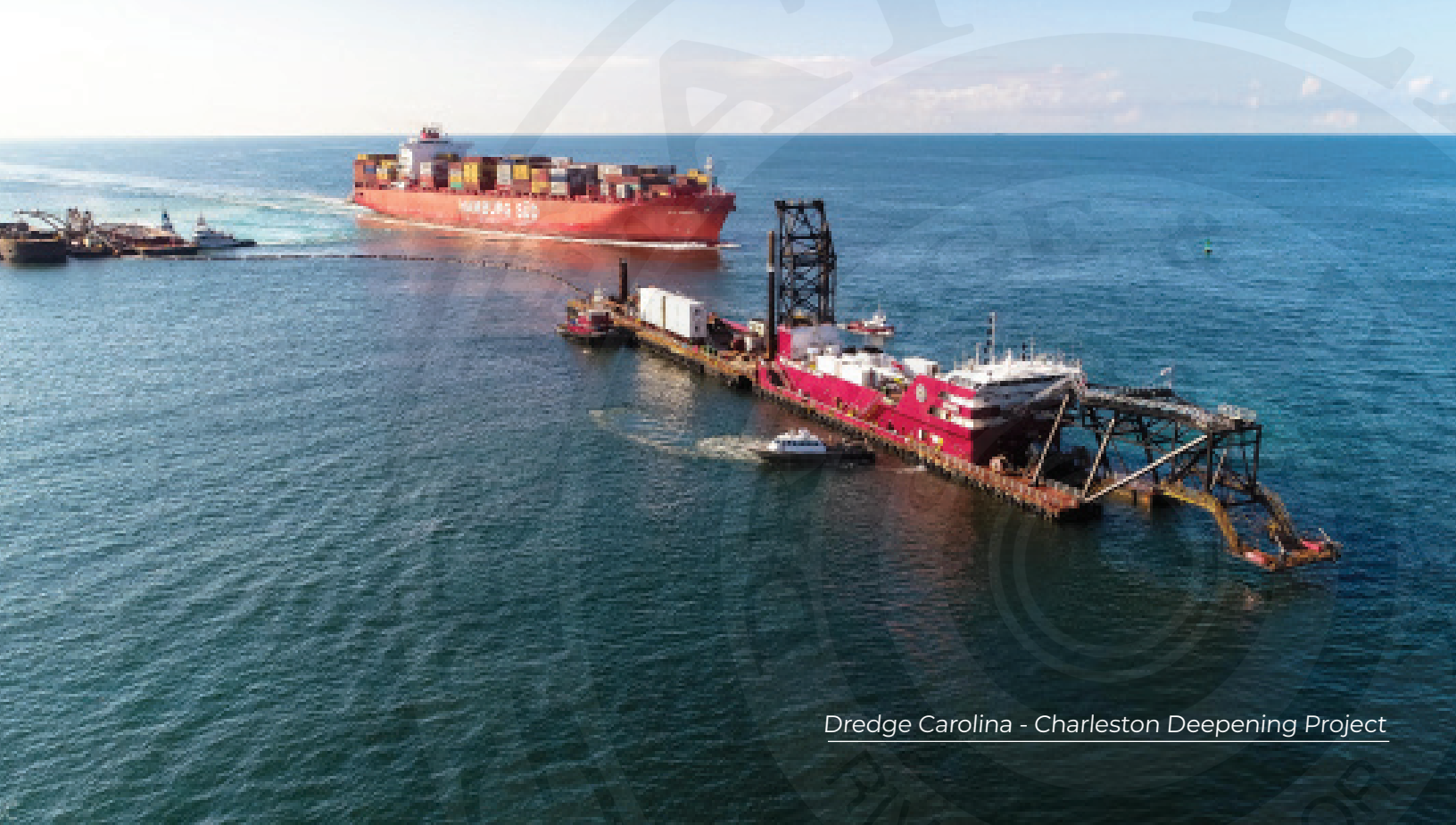
Dredge Carolina - Charleston Deepening Project