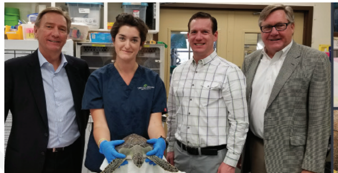
Georgia Sea Turtle Center